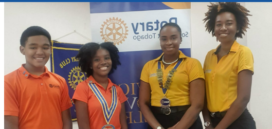
RC SouthWest Tobago