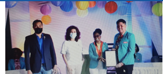
Rotaract: Paramaribo Fresh