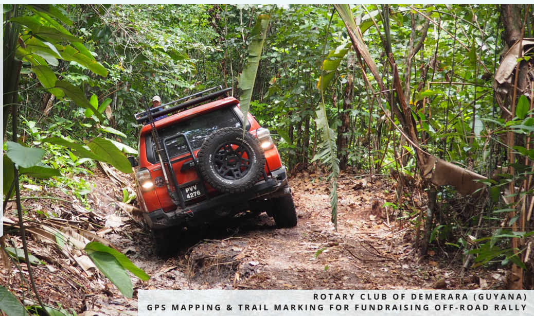
ROTARY CLUB OF DEMERARA (GUYANA) GPS MAPPING & TRAIL MARKING FOR FUNDRAISING OFF-ROAD RALLY