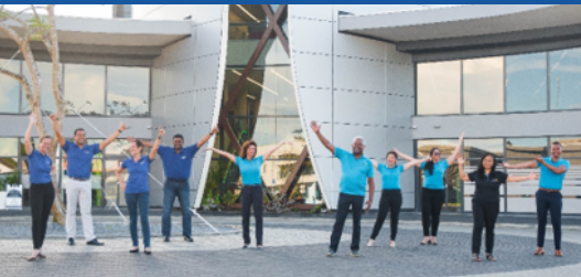
RC Paramaribo Residence