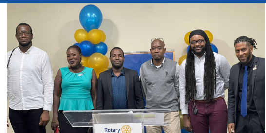
RC Satellite St. Lucia Sunset