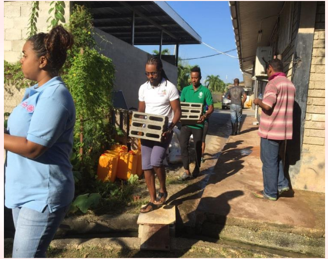
Box Garden – East Clubs