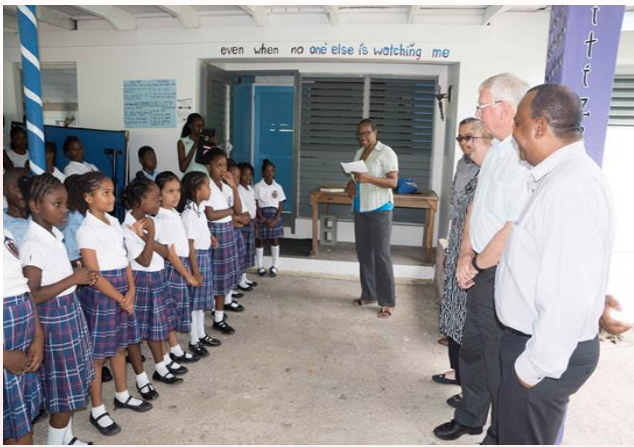
Primary School dictionary & 4 way test