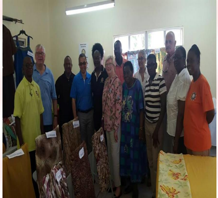
RC Antigua Computer & Sewing centre