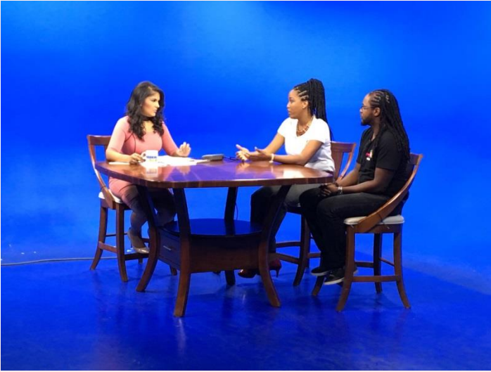
Interview on CNC Morning show.