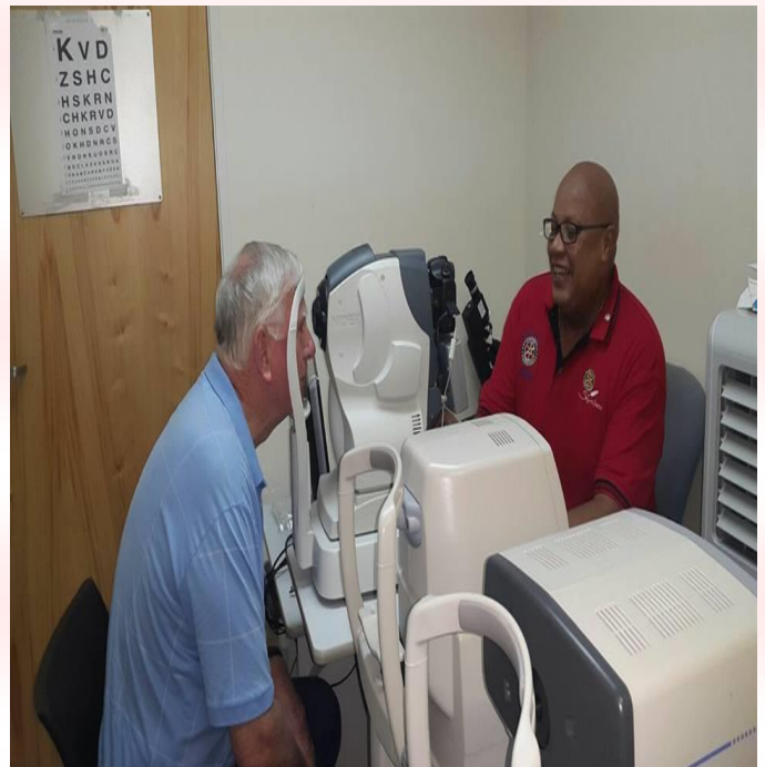
RC Antigua Sundown Waterproject and Digital *Fundus Camera