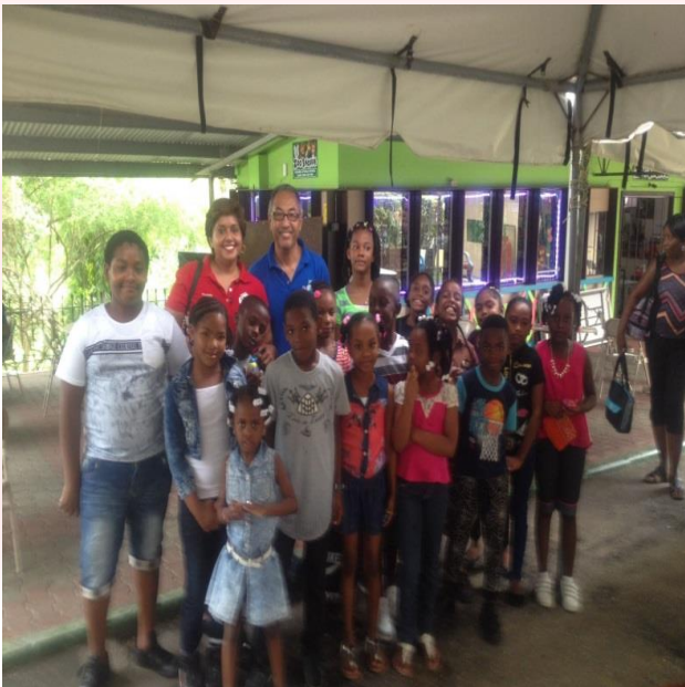
RC San Fernando Mayaro Homework centre Zoo visit