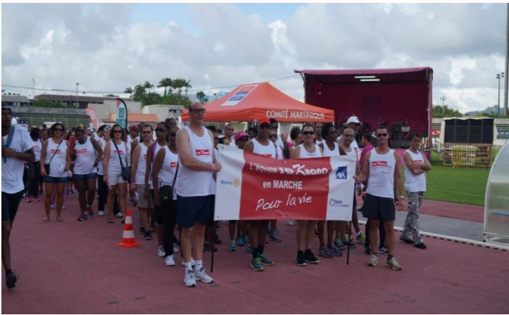
Martinique Inter Clubs 24h KRONO team