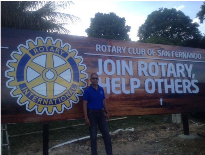
Rotary Club of San Fernando Signage and Bench Donation at St. Benedict's College