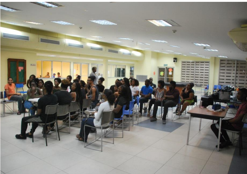
Fellowship games Piarco UWI