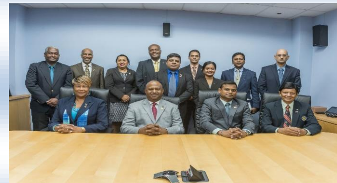
San Fernando South