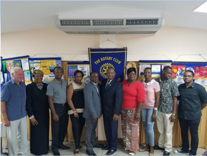
South West Tobago