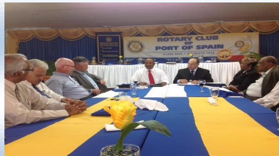
Port of Spain