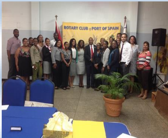
Port of Spain