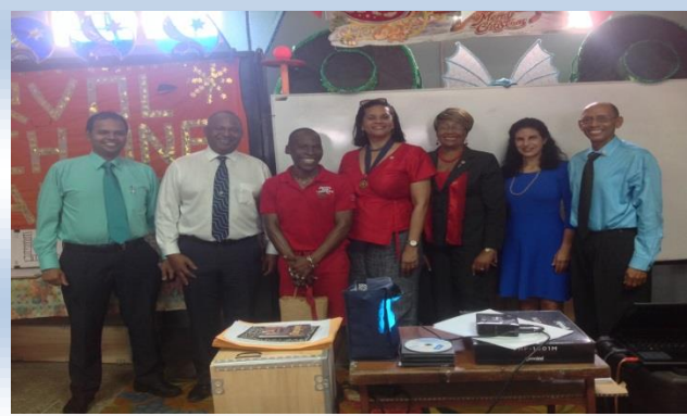
Port of Spain Central