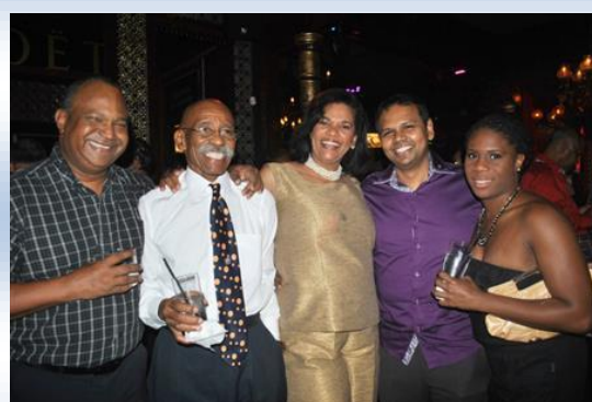
Cocktails at Paprika