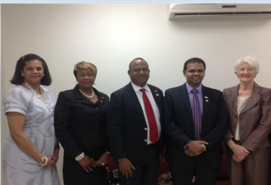
District Governor & Presidents