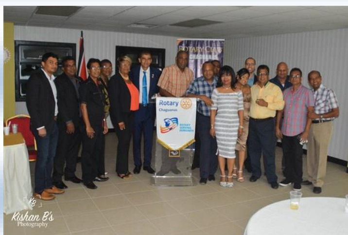
Cocktails at YTEPP Building