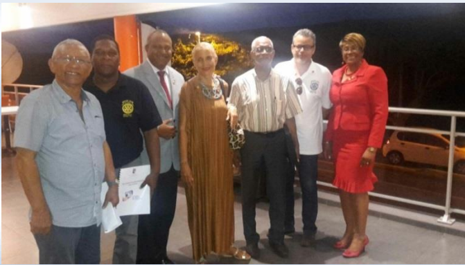
Fort de France Ouest