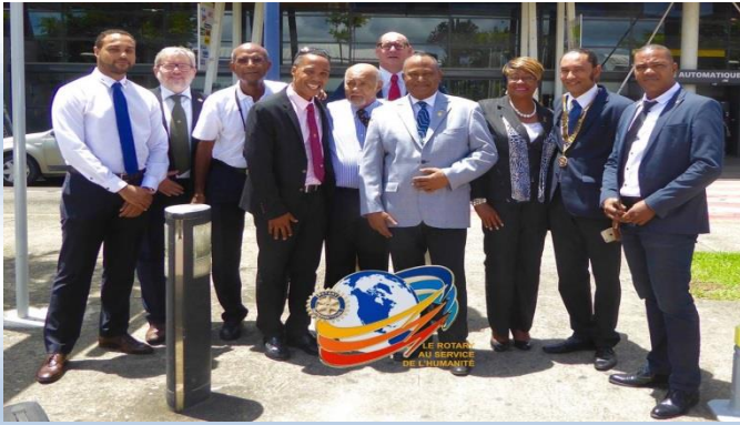
Welcome Party at Airport