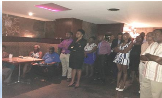
Cocktails at Euasia Resturant