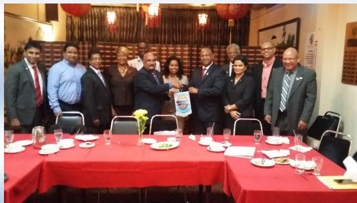
Maracas/ St. Joseph