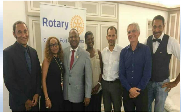
Fort de France