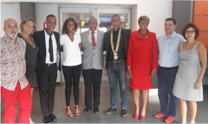
Fort de France Sud