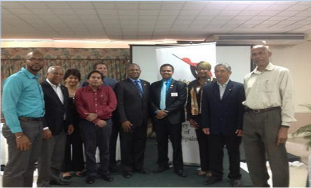
Port of Spain West