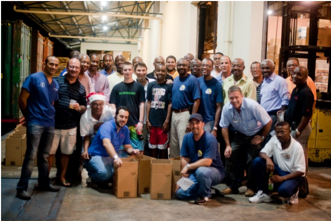
Christmas hamper packing: Just one of our current Community Service commitments.