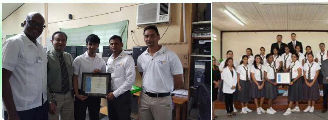
Charter ceremonies of Asja Boys College Interact Club (left) and Parvati Girls Hindu College Interact Club (right)