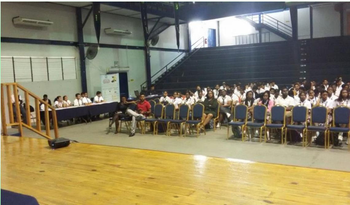
Students of the four Interact clubs paying attention to the Trinidad and Tobago Police Service Presentation at the Smarter on the Road Project