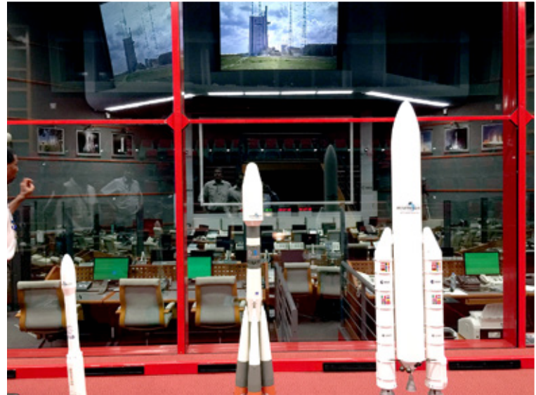
Control Room at Space Centre

The highlight of the visit to Kourou was a tour of the Space Centre. It is a sprawling complex housing various launch pads, administrative and assembly buildings and central