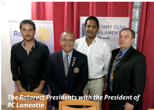
The Rotaract Presidents with the President of RC Lamentin