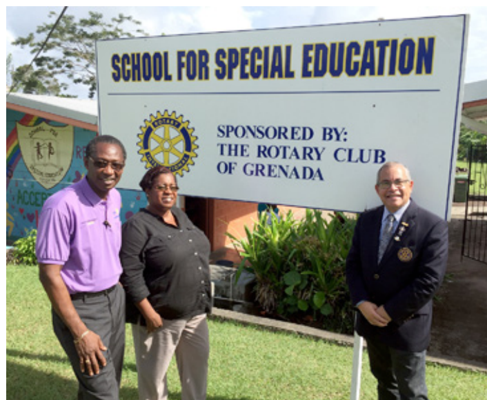
School for Special Education

group activities. By all reports, the attendees had a wonderful time.