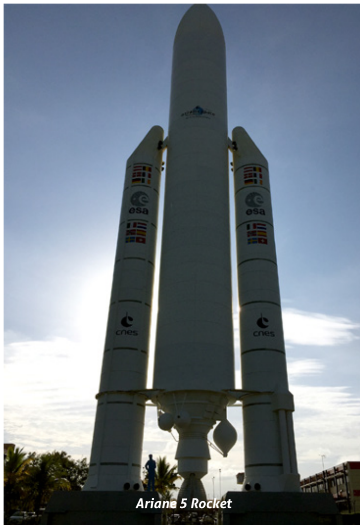
Ariane 5 Rocket