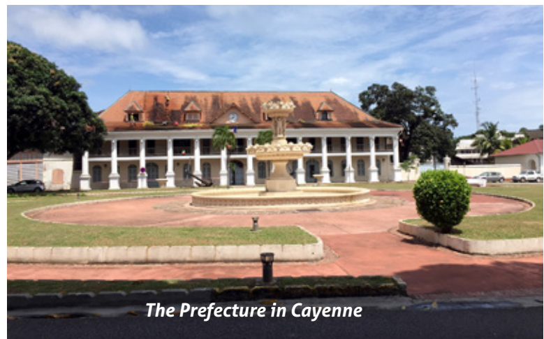
The Prefecture in Cayenne

The Pasteur Institute has been in French Guyana for 75 years and provides research and public health services there. There is a lot of research being undertaken in understanding transmission, dissemination and resistance of certain viruses largely endemic in French Guyana, by studying their genetic and immunological properties. We saw this in action with the studies on the Aedes Aegypti mosquito currently ongoing at the Institute.