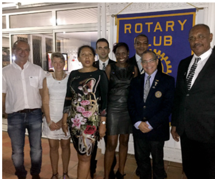
RC Cayenne Est

The visit culminated in a gala evening with the clubs.