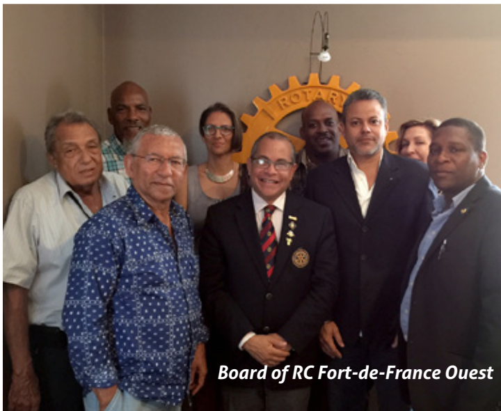
Board of RC Fort-de-France Ouest

Wine project – selling of wine to raise money – Fort-de-France Ouest