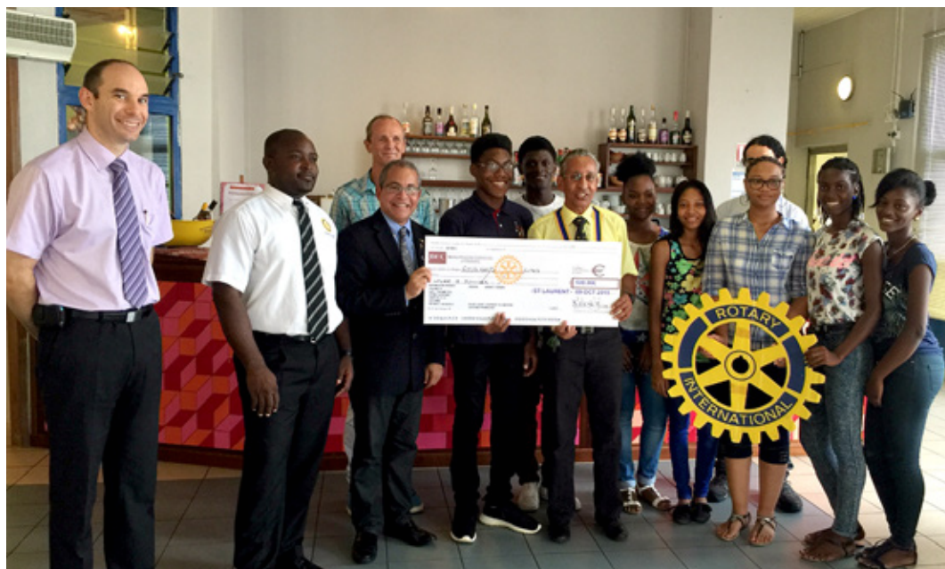
Presentation of cheque to students who visit the Kennedy Space Centre

Walk for the fight against cancer – St. Laurent du Maroni Mana