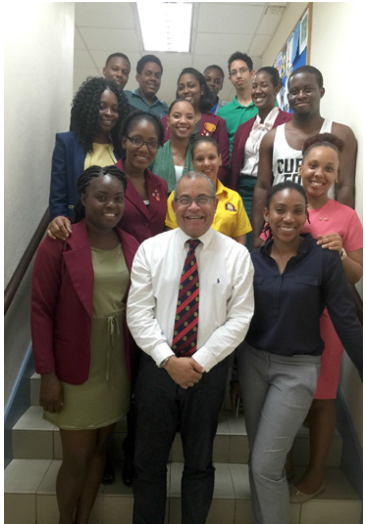
Meeting with the Rotaractors