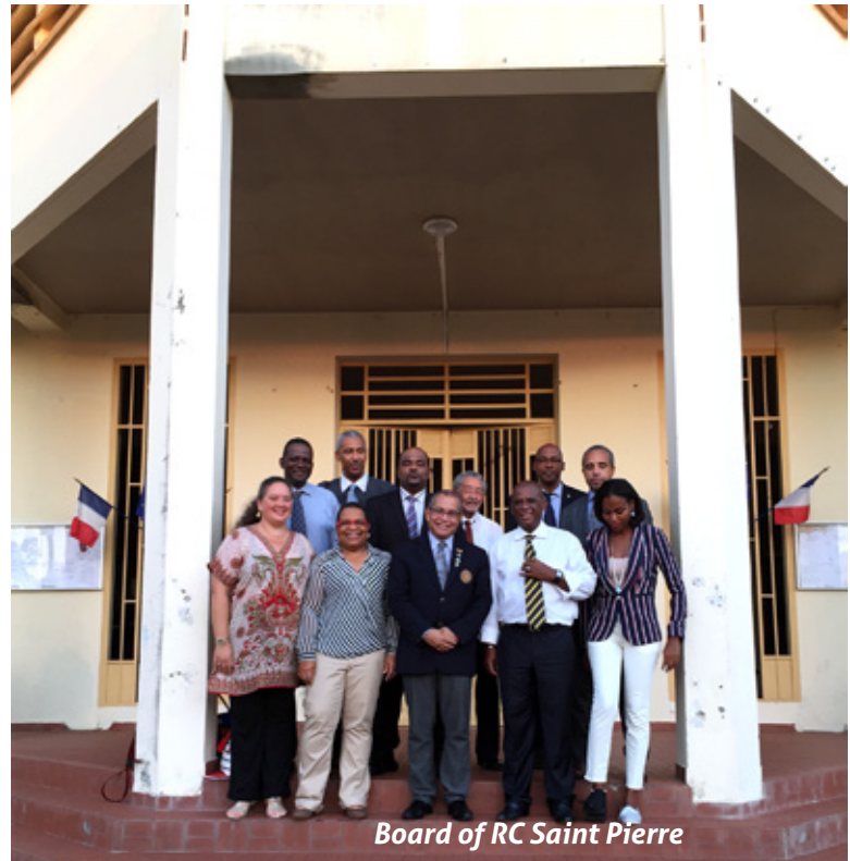
Board of RC Saint Pierre