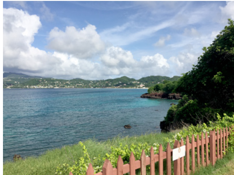
Quarantine Point overlooking Grande Anse

The Rotary Clubs of Grenada hosted the RYLA Conference this year. It was a superb conference, with some 80 participants, filled with informative lectures, guest speakers and