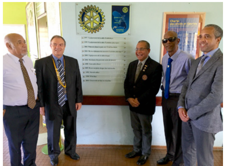
Plaque at OMASS showing the projects of RC Lamentin