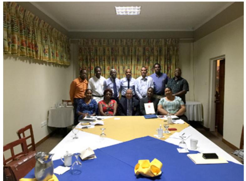
Board of RC Grenada