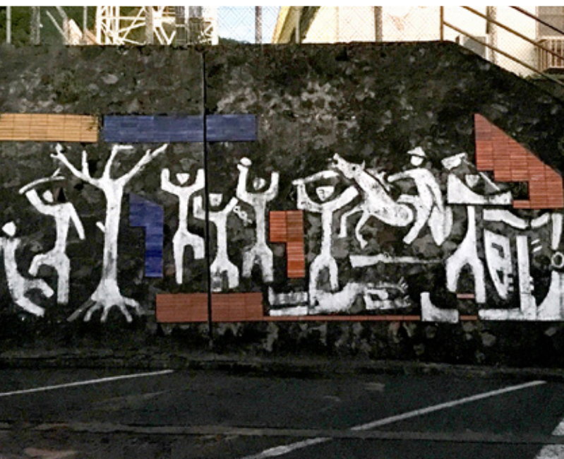
One of the murals in Saint Pierre