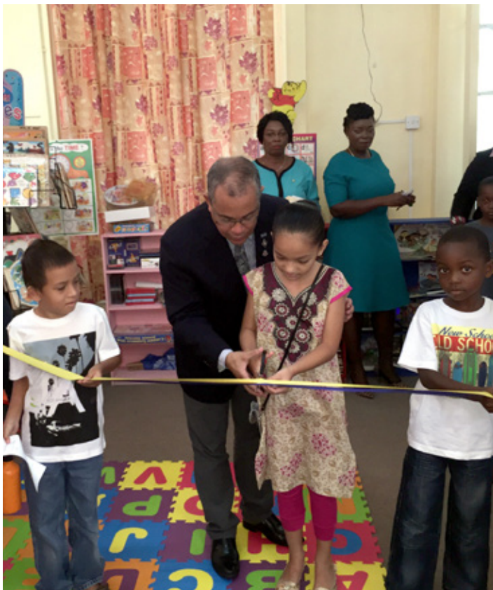
Opening of the Toy Library