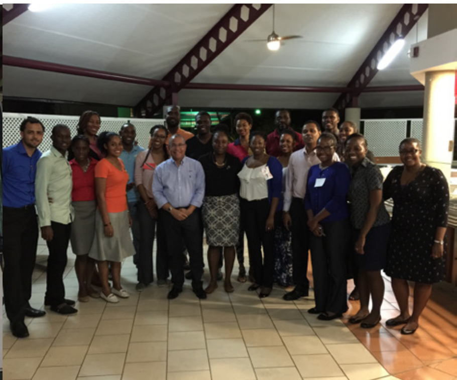
Rotaractors of North Trinidad