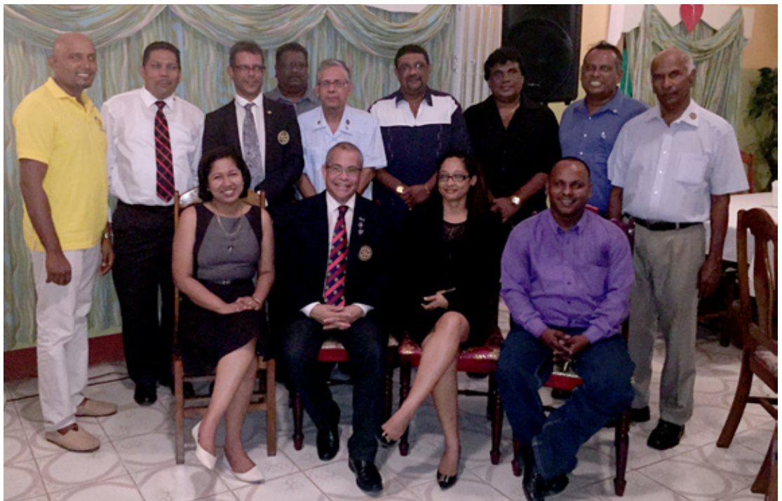
RC New Amsterdam