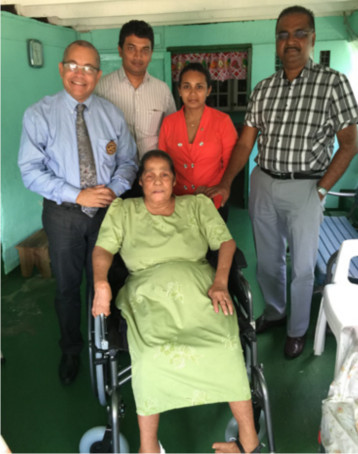
Delivery of wheelchair in Chaguanas

My third visit to Trinidad to the Central Clubs started with delivering a wheelchair to a lady in Chaguanas. This was followed by a lunch meeting with the Chaguanas Club and then a visit to the Interact Club at Presentation College in Chaguanas. Later that afternoon, there was a tour of the Caroni Swamp and Bird Sanctuary.