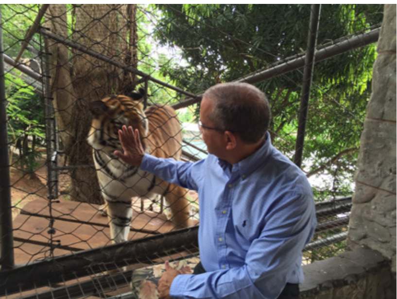
Patting the tigers