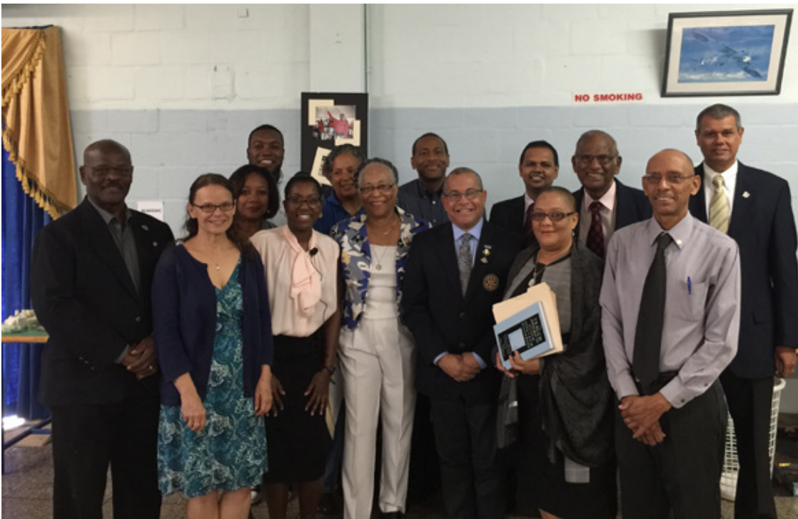
Opening of the TEACCH Autism Programme.