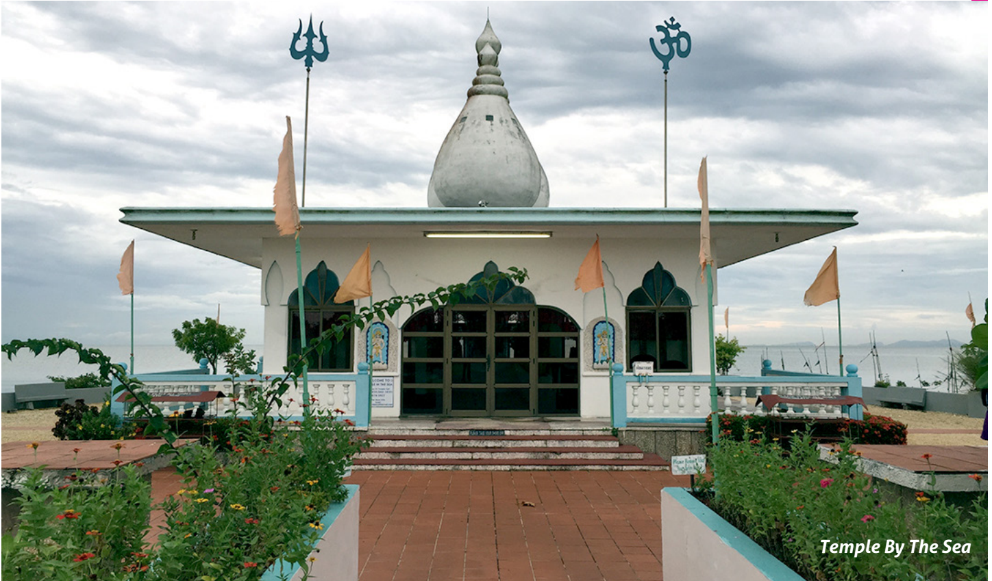
Temple By The Sea