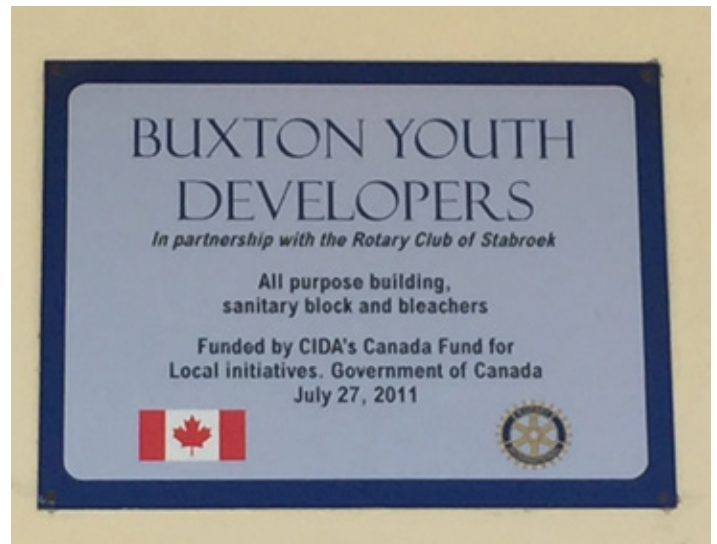
Buxton Youth Development Project