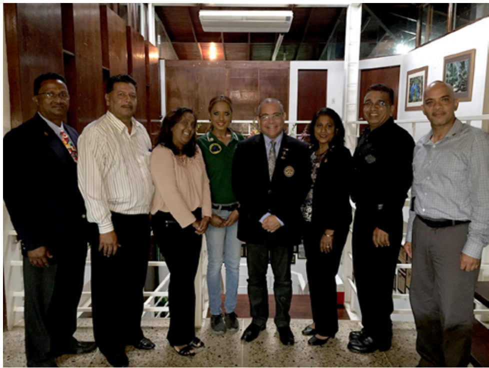
RC San Juan