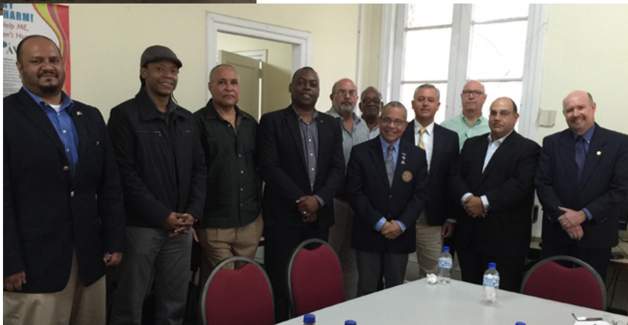
RC Port of Spain