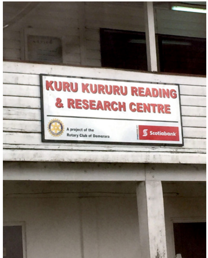
Kuru Kururu Reading & Research Centre