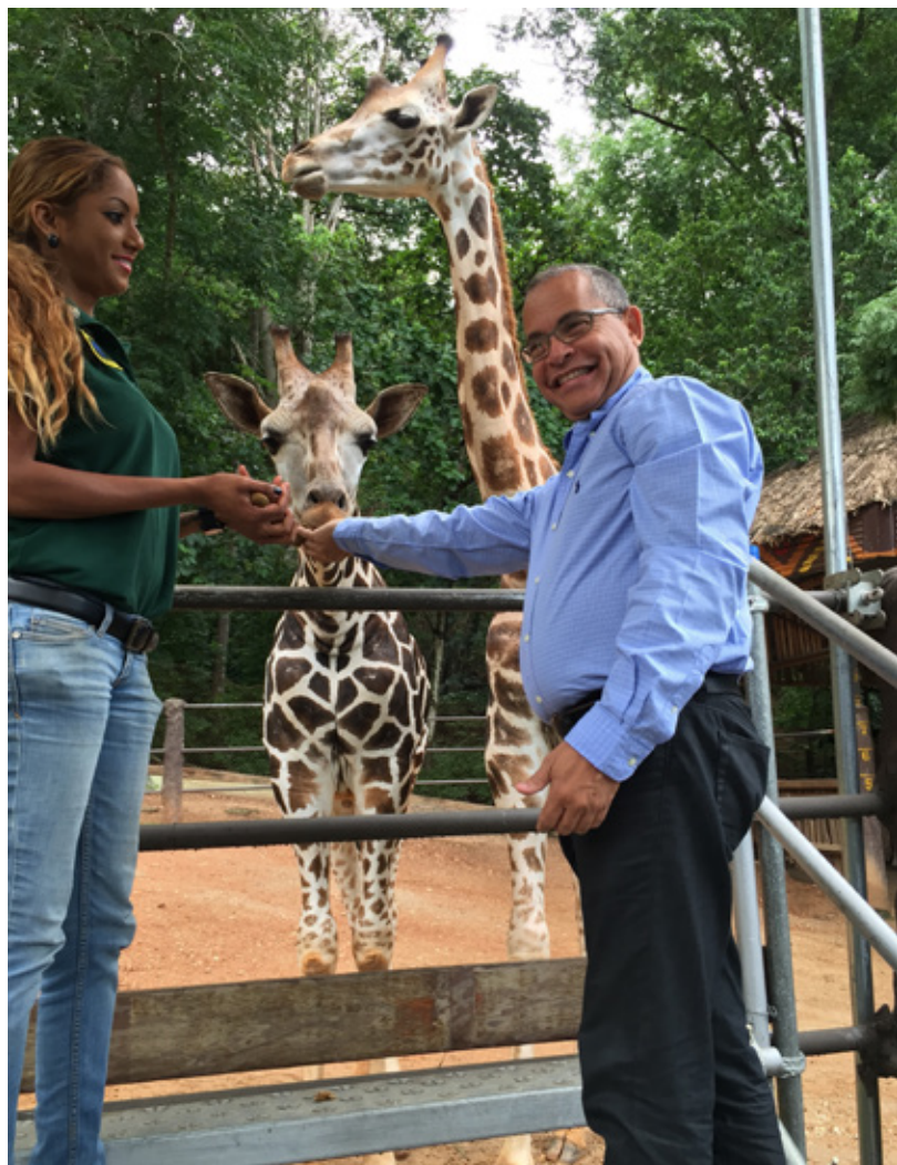
Feeding the giraffes