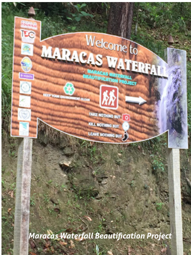
Maracas Waterfall Beautification Project