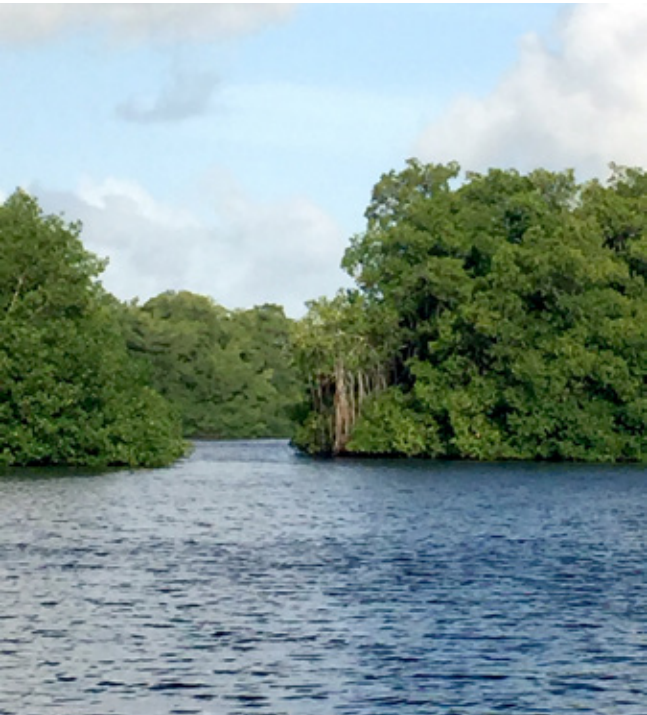
Caroni Swamp & Bird Sanctuary