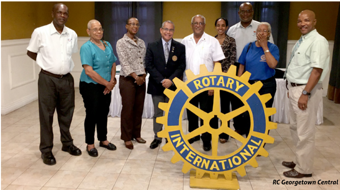
RC Georgetown Central