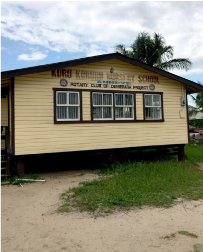
Kuru Kururu Nursery School